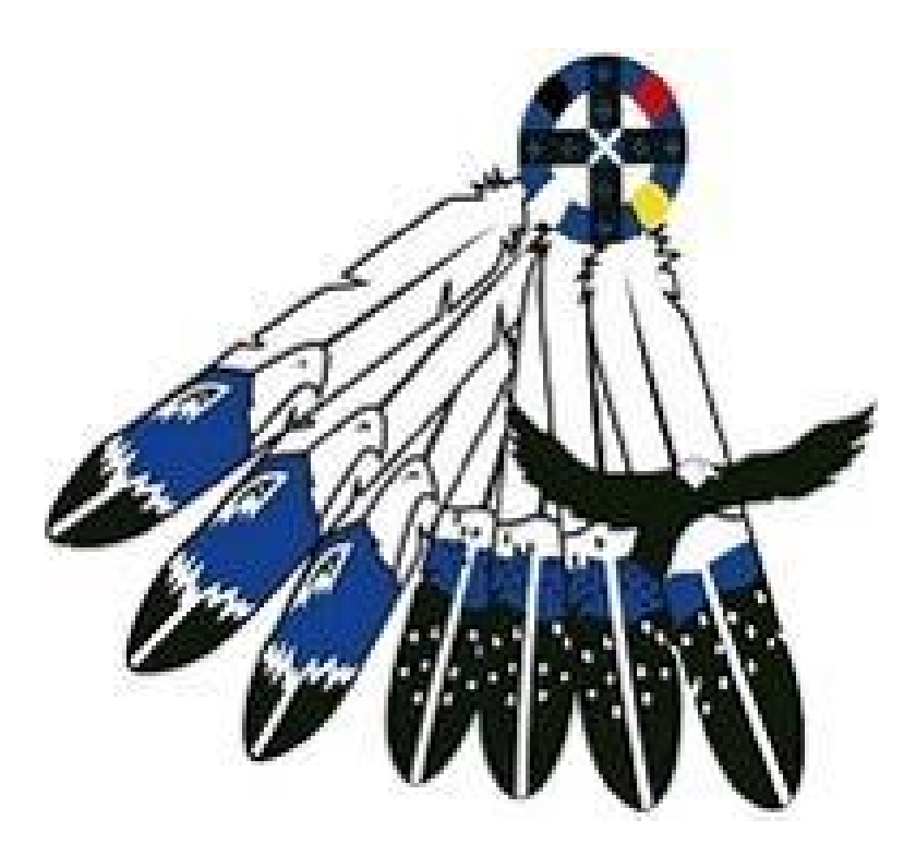
Approved by Takini School Board Action September 11, 2023 CRST TED Committee Approved on 10.19.23